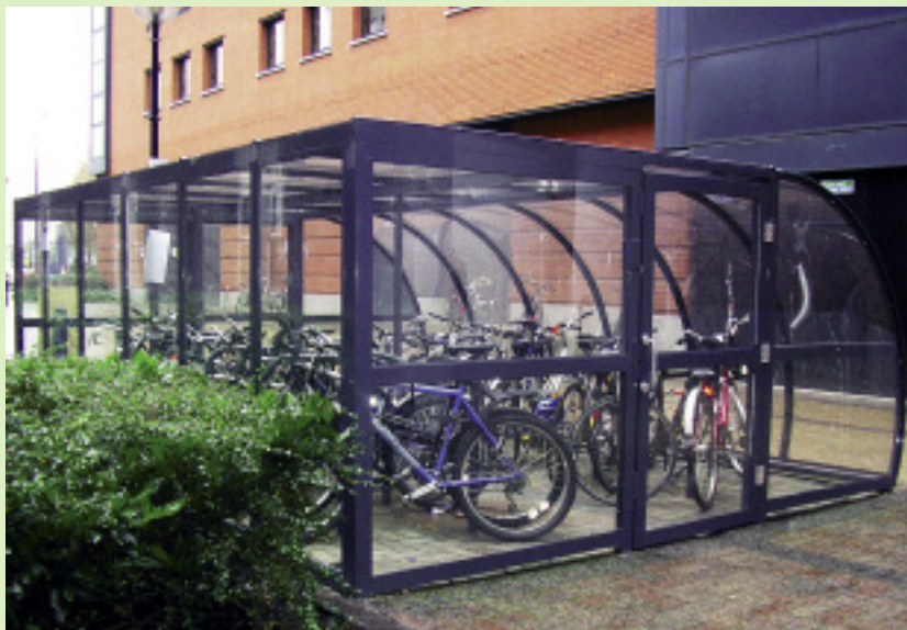
The new shelter outside the Geoffrey Manton Building has space for 20 cycles.