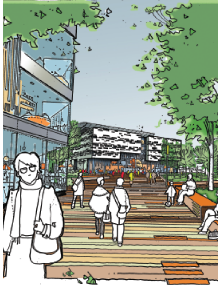
View across new campus, above; and below the main academic building dubbed the 'Sugar Cube' due to its contemporary design.