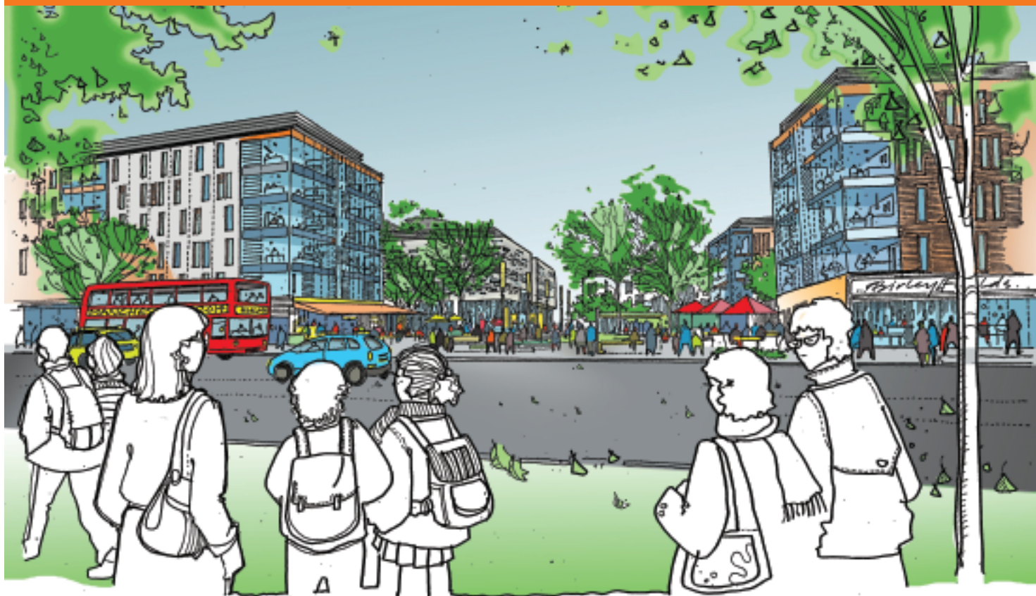
A view from the Stretford Road of student residences and the campus beyond.

December 03, Friday – Zion Arts Centre, 2 – 6pm