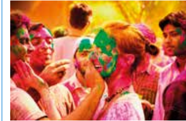
Tourist with students of Jawaharlal Nehru University celebrate festival Holi on March 20, 2011 in Delhi, India.

Holi is a spring festival, signifying the victory of good over evil. Sometimes known as the Festival of Colours or the Festival of Love, Holi is celebrated with a carnival of colours, where participants chase one another with brightly coloured powders and water.