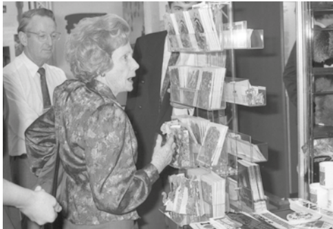
Dame Barbara Castle, veteran Labour party politician and former Cabinet minister, visits a stand at the party conference on October 1, 1991 in Brighton. She died in 2002.

Barbara Castle (1910-2002), British Labour politician and former Secretary of State