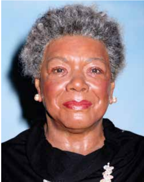
A wax figure of Maya Angelou is seen on display at Madame Tussauds on December 6, 2013 in New York City. Image: Maya Angelou JStone/Shutterstock.com

Maya Angelou (1928-2014), American Author and Civil Rights Activist