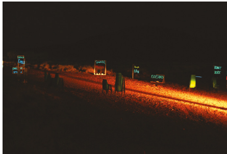
Light and Language: Linda Persson with Wongatha women Geraldine and Luxie Hogarth with parts of the community of Leonora, Desert of Eastern Goldfields Australia